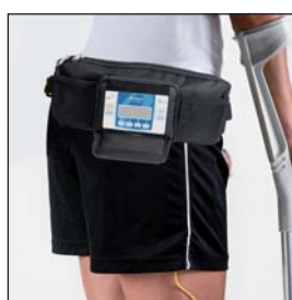
Rythmic Evolution in banana transport bag