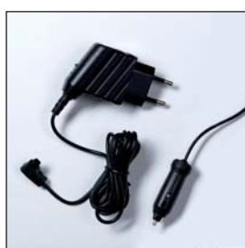
Power supply and 12 V adaptor