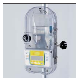
Rythmic Organiser 501 for up to 500ml external bag