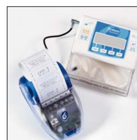
Rythmic Evolution and plug and play printer for events down load