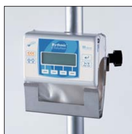
Rythmic Evolution on Pole clamp