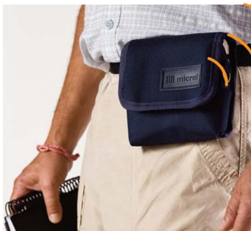
Truly ambulatory system